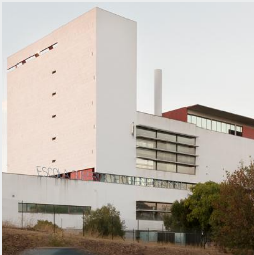
Polytechnic University of Lisbon, School of Communication and Media Studies, Portugal