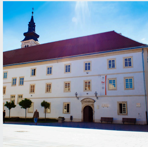
University of Zagreb, Faculty of Organization and Informatics, Croatia