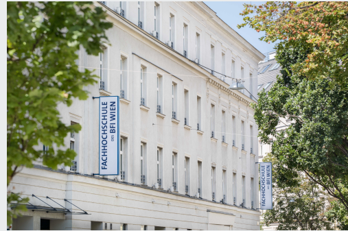
University of Applied Sciences BFI Vienna, Austria