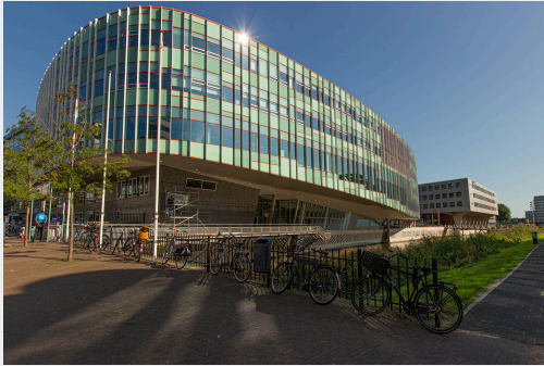
Amsterdam University of Applied Sciences, Netherlands